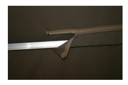
Heavy-duty #10 YKK zippers