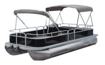
Convert it into a single bimini top