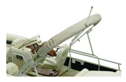
(2) Free matching boots included