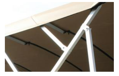
Zippered bow pockets - Fast removal