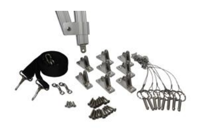
1.25" Square frame-Stainless steel hardware